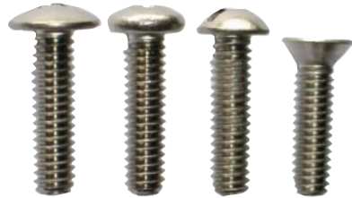
Available head styles: Pan, Flat, Truss, Oval, and Round