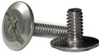
U.S. Letters Patent No. 6,328,517 (Combination Drive) No. 6,481,944 (Phillips) No. 6,682,283 (Square & other drives)